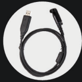
Programming cable (USB port)