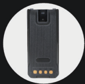
Li-polymer battery 2400mAh